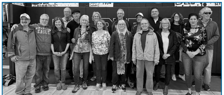
RNHS class of '73 came back for a tour of the campus to mark their 50th reunion.